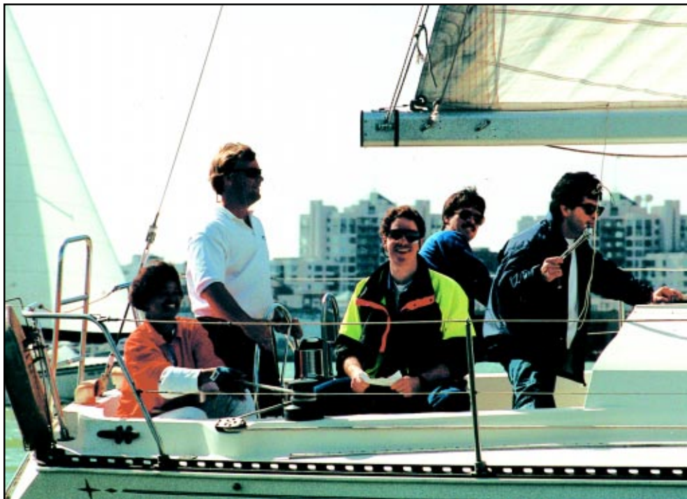
San Francisco is the Perfect Venue for Sailing Programs.